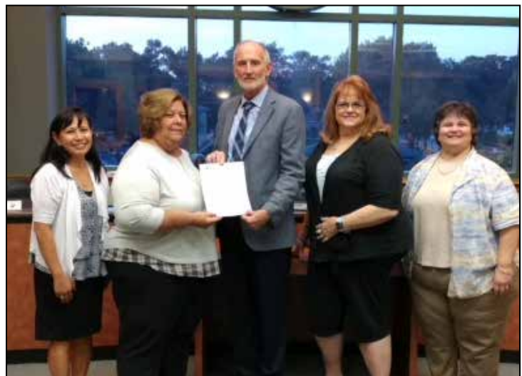
2018 First Place Winner: Chicago Chapter

Please submit entries in a Word document or PDF file.