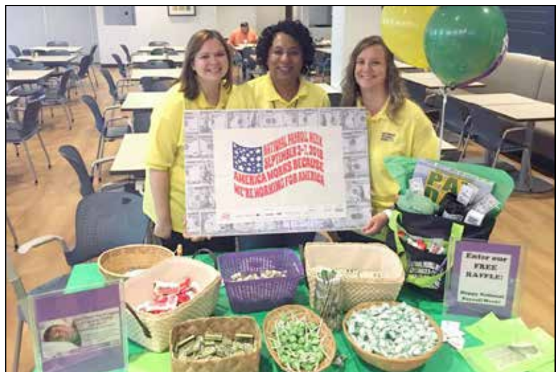
2018 First Place Winner: Atlanta Chapter